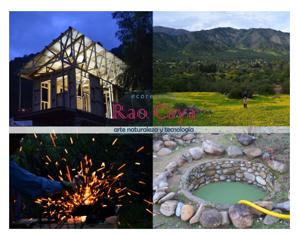
Rao Caya, Alhué, Chile.