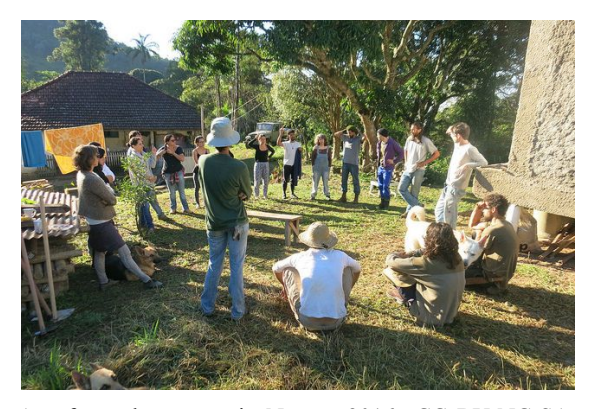
Agroforestal systems in Nuvem 2016 CC BY-NC-SA 3.0

Since 2014 Minkalab has organised various meetings, mingas and collaborative projects in the space.