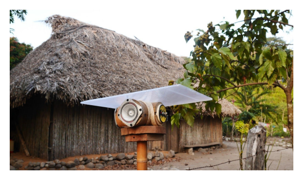
Selvatorium - Anti Vamp circuit by Constanza Piña

Rural culture, traditionally based on the construction of tools and technologies in order to guarantee a self-sustainable survival, could now be recognized or misread as the culture of DIY (Do It Yourself). However, differently from the DIY, the transmission and exchange of this knowledge represent a value of negotiation, which conforms the local socio-environmental dynamics.