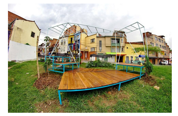
View of the Manga Libre. The structure was created in collaboration with the collectives Todo Por la Praxis (España) and Proyecto NN (Medellín). In the distance is the community vegetable garden and beyond, colorfully painted, the Platohedro house. Source:: Platohedro.org | licencia CC BY-NC-SA 3.0

community, a key element in the project. These relations develop reciprocal exchange which feed the transmission of knowledge to and from the community. The building, built with adobe and integrated into the slope of the mountain, is a practical example of the philosophy of Goctalab and provides accommodation as well as a big well equipped studio/workshop for making projects. Our next step is to construct a freely accessible center for multimedia resources which will function as a seed bank, a library and a community cinema.